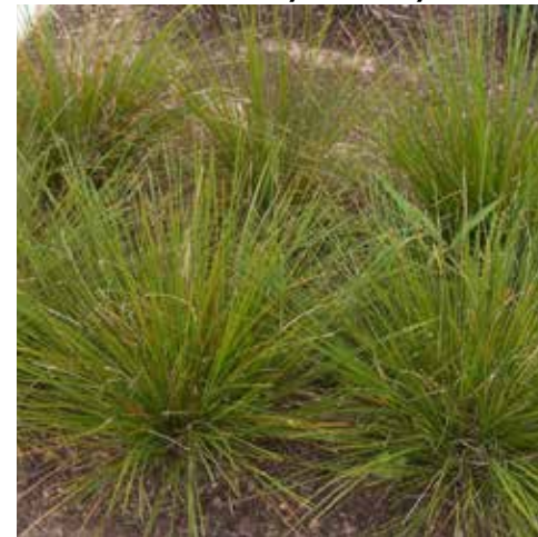
Lomandra longifolia 'Breeze' Dwarf Mat Rush