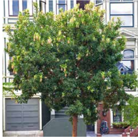
Arbutus x marina Arbutus Standard