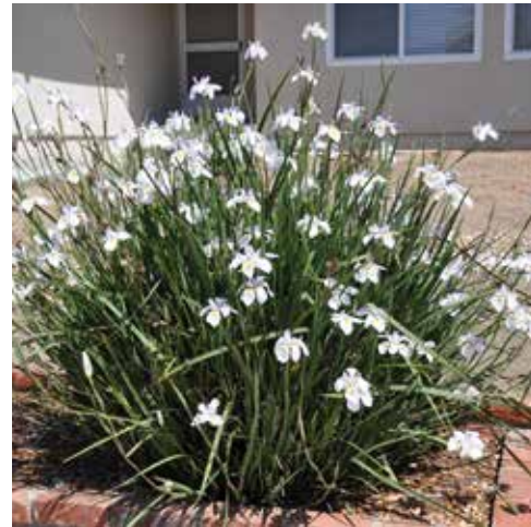
Dietes vegeta African Iris