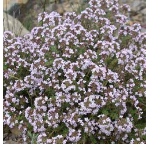
Thymus vulgaris Common Thyme