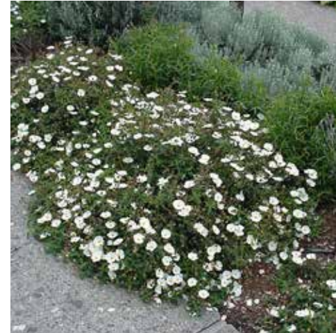
Cistus salvifolius Sageleaf Rockrose