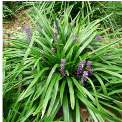
Liriope muscari Lily Turf