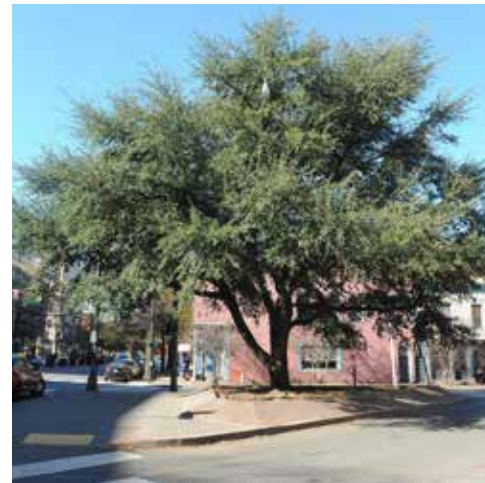
Quercus agrifolia Coast Live Oak