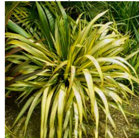
Phormium tenax 'Yellow Wave' New Zealand Flax