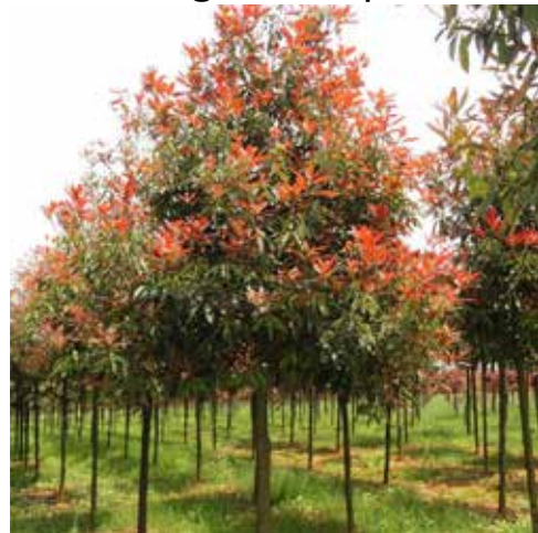
Photinia x fraseri Photinia