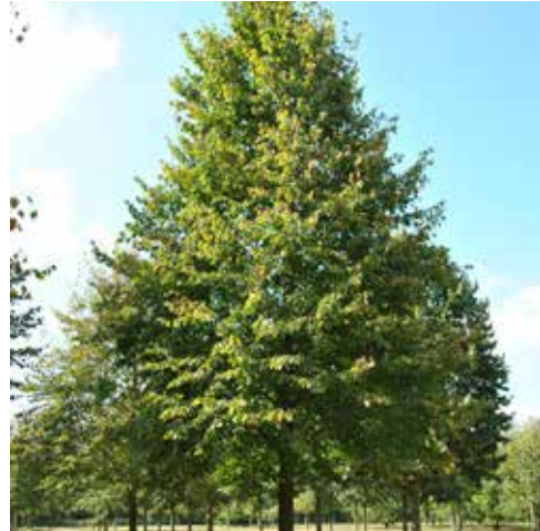
Tilia cordata Littleleaf Linden