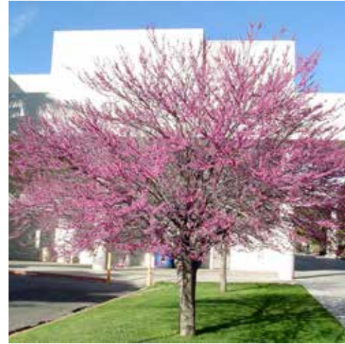
Cercis occidentalis Western Redbud