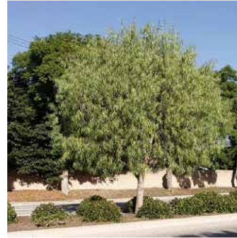
Geijera parviflora Australian Willow