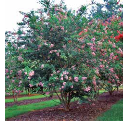
Lagerstroemia indica 'Muskogee' Muskogee Crape Myrtle