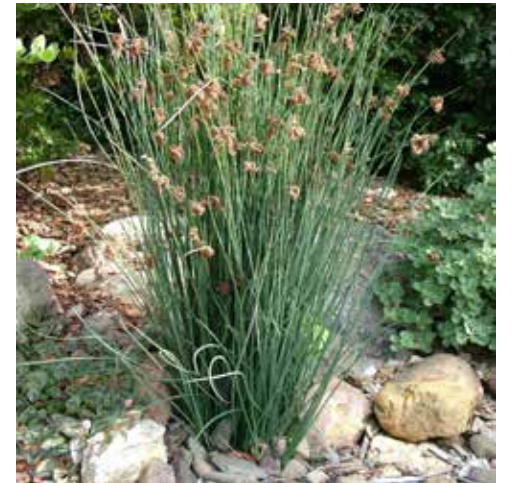
Juncus patens California Gray Rush