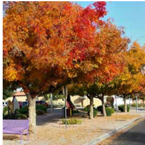
Pistacia chinensis Chinese Pistache Multi-Trunk