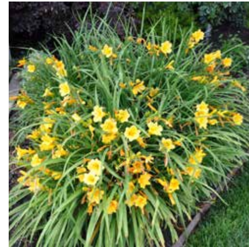
Hemerocallis x bitsy Yellow Daylily