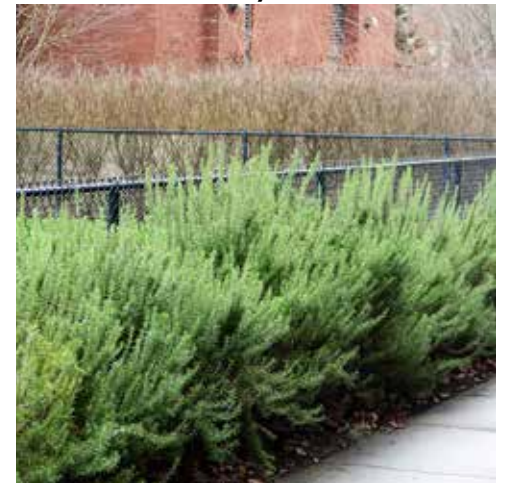
Rosmarinus officinalis Rosemary