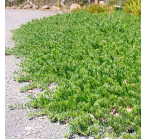
Myoporum parvifolium Putah Creek Myoporum