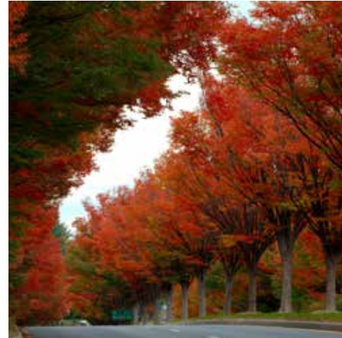
Zelkova serrata City Sprite Zelkova