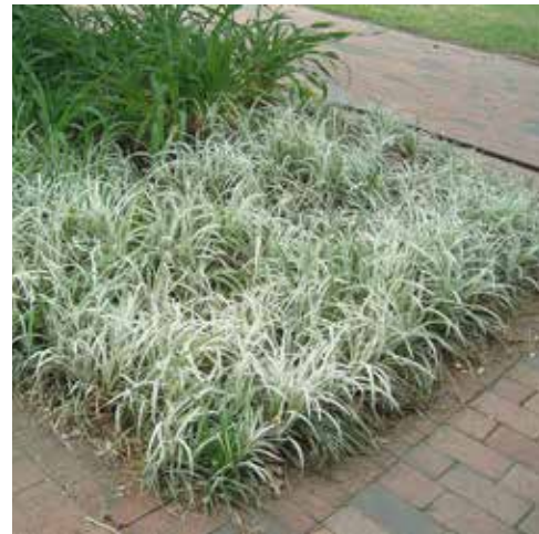
Leymus triticoides Wild Rye