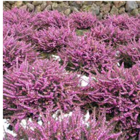
Erica x darleyensis Darley Heath