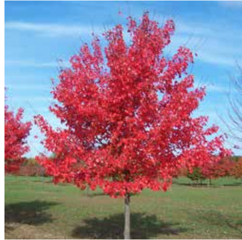
Acer rubrum 'Armstrong' Armstrong Red Maple