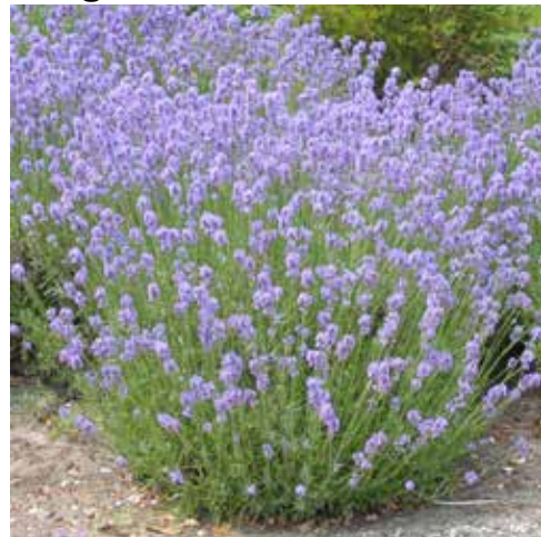
Lavandula angustifolia English Lavender