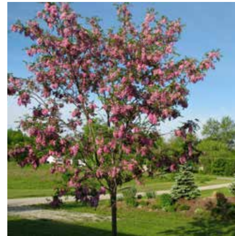
Robinia x ambigua Pink Flowering Locust