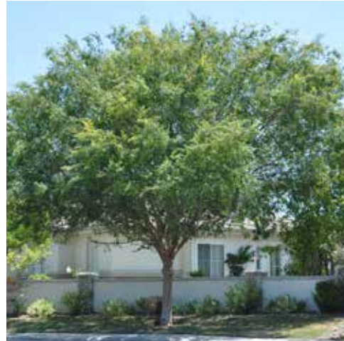
Ulmus parvifolia Chinese Elm