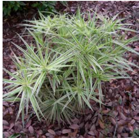
Carex phyllocephala Sedge