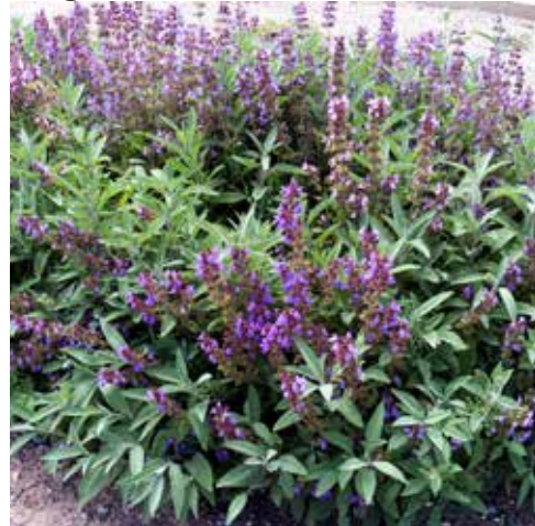
Salvia officinalis Garden Sage