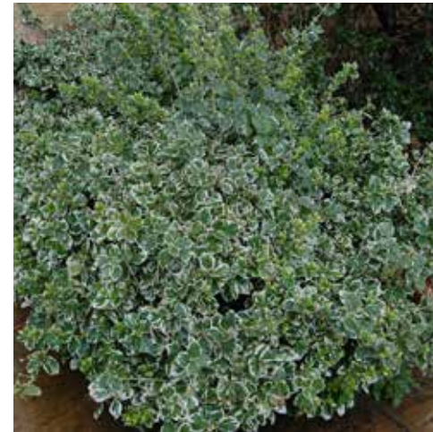
Euonymus fortunei Emerald Gaiety Euonymus