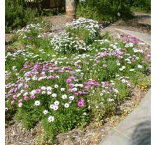
Osteospermum fruticosum Freeway Daisy