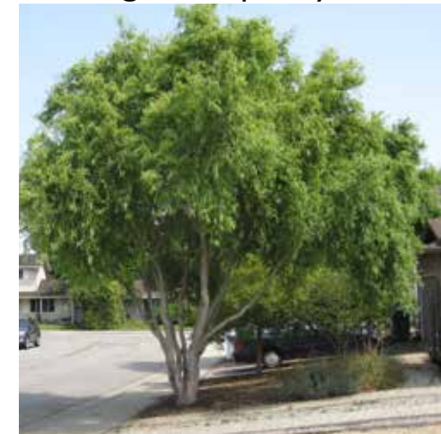
Salix matsudana Corkscrew Willow