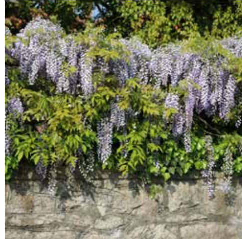
Wisteria frutescens American Wisteria