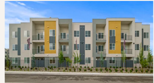
Examples of other Quarterra communities